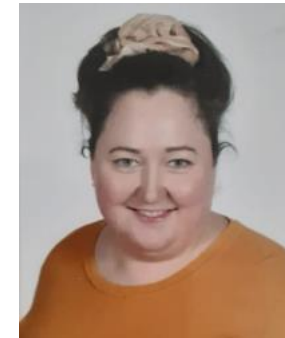
Miss Horne usually Monday and Wednesday mornings (shared between both year 4 classes)