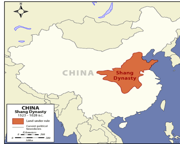
Map showing the expanse of the Shang Dynasty between 1523 and 1028 BCE.

The Dynasty has become famous for the artistry of its bronze and jade work .